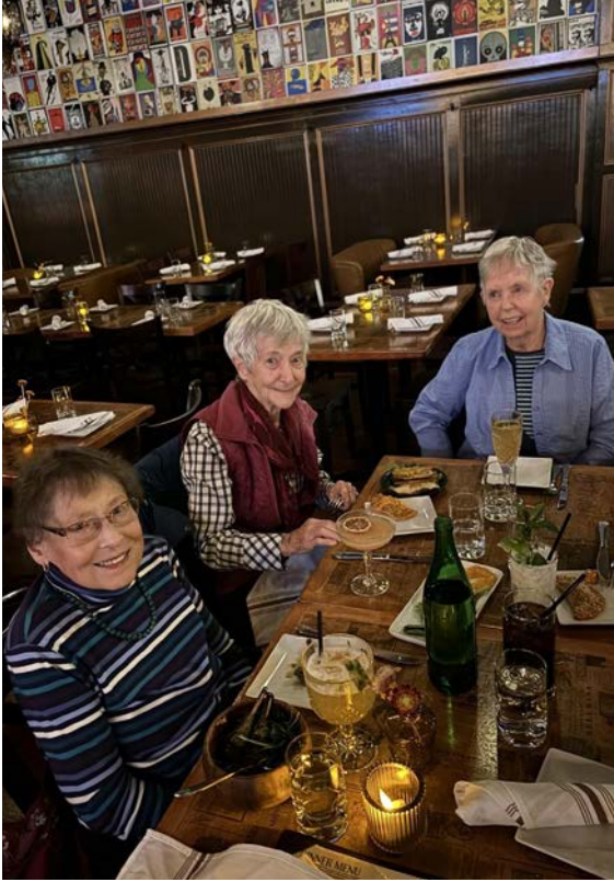
DINNER TRIP to Gustazo's in Waltham