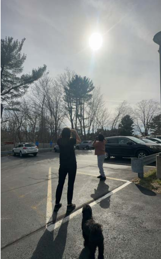
STAFF LOOKING AT SOLAR ECLIPSE