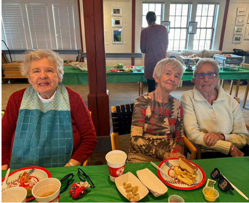
OPENING DAY Luncheon