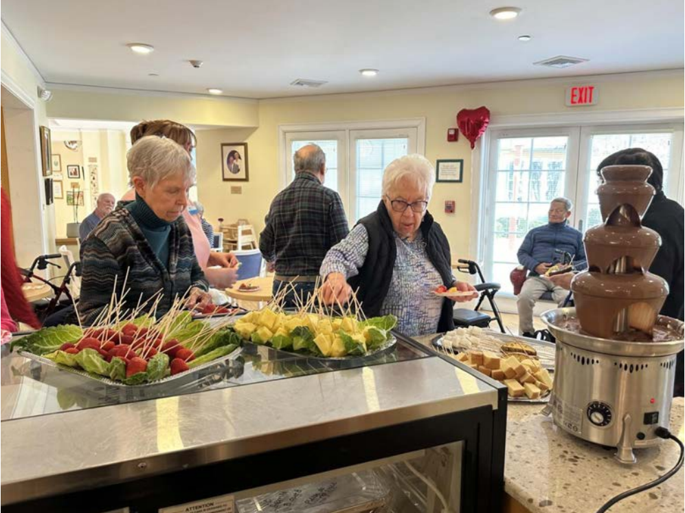
CHOCOLATE FONDUE Social Hour

TAKE A LOOK AT OUR ROBUST COMMUNITY PROGRAMMING where neighbors from all around continue to enjoy the interactions made possible by the many different spaces, inside, outside, and virtually.