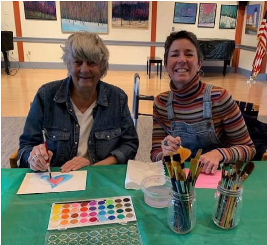
MOTHER AND DAUGHTER at Arts & Crafts